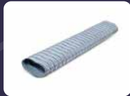
Corrugated Flat Duct 20x70mm