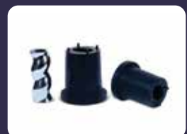
Spiral Worm & Rubber Stator