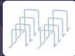
PT Barchair 6mm & 8mm