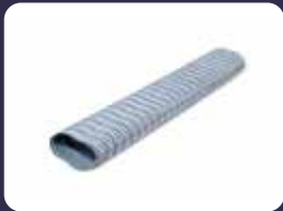
Corrugated Flat Duct 20x50mm