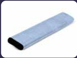
Smooth Flat Duct 20x47mm