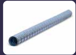
Corrugated Duct 40 to 150mm