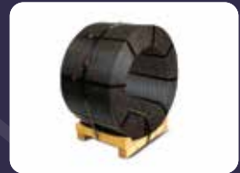
PC Strand - 12.7 & 15.2mm