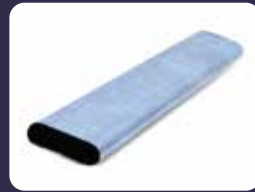
Smooth Flat Duct 20x70mm